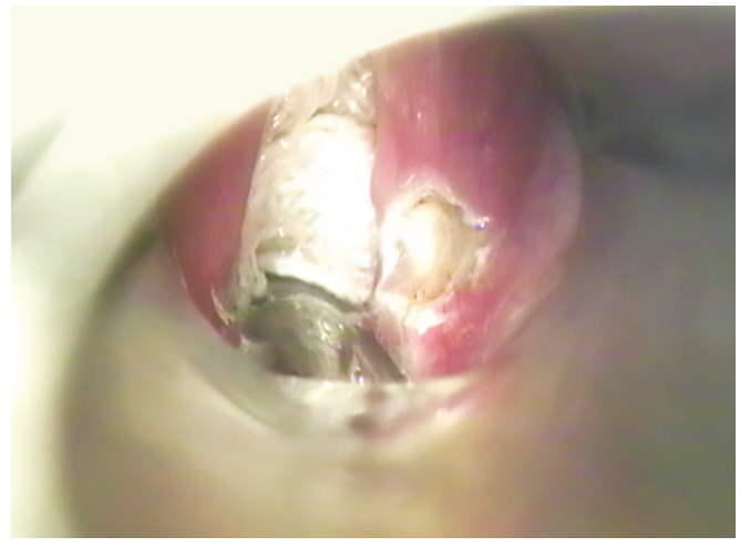
Fig. 1: Coblator-assisted cordectomy initiated at the free margin of true vocal fold just anterior to vocal process.

in further confirmation of the diagnosis of vocal cord paralysis as the joint can be moved easily on passive rotation, whereas, it is extremely stiff and immobile in case of a joint fixation. In case of posterior glottis stenosis, even the opposite joint moves on rotating one joint. Roughly, 2 mm by 5 to 6 mm sleeve of muscle, just anterior to the vocal process was excised in all the cases unilaterally in patients undergoing coblator-assisted posterior cordectomy (Figs 1 and 2). Whereas in patients undergoing CO<sub>2</sub> laser-assisted posterior cordotomy, the vocal fold was merely incised just anterior to the vocal process extending 4 to 5 mm laterally into the false vocal folds (Figs 3 and 4). The procedure was required to be repeated on the opposite side in 3 of the tracheostomized patients (two in the laser group and one in the coblator group) following one week of decannulation owing to a recurrence of dyspnoea. No untoward pre- or post-operative events were recorded. The 18 tracheostomized patients were given a decannulation trial with a subsequent decannulation 48 hours following the surgery. Three patients developed recurrence of dyspnoea one week following