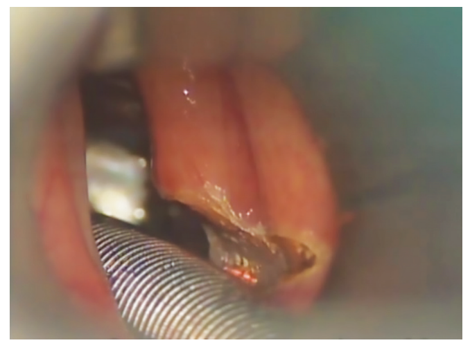
Fig. 4: Laser-assisted cordotomy completed.