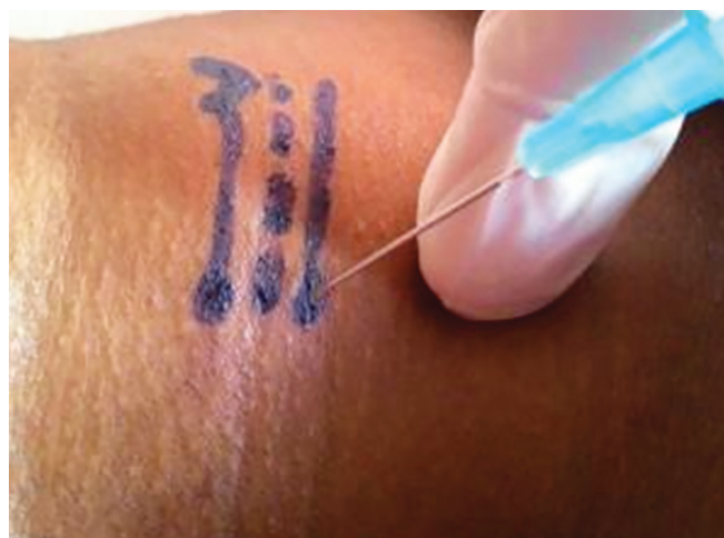
Fig. 2: External marking for wide-bore needle insertion