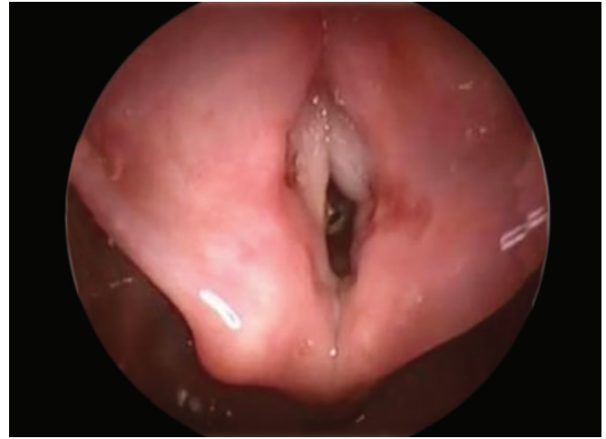
Fig. 5: Postoperative status of vocal cord with cord being lateralized

the outside. The loop around the vocal fold is pulled until it gets sufficiently lateralized. The intraoperative final appearance of the lateralization of vocal cord appears as mentioned in Figure 4. The ends of the suture were tied externally by eight knots and then buried subcutaneously. The complications associated with this procedure were analyzed during surgery and immediately during the follow-up. Postoperatively the results of this surgery were analyzed. The lateralization of the vocal cord appears as mentioned in Figure 5 during the postoperative period allowing sufficient space for breathing with an acceptable social voice.