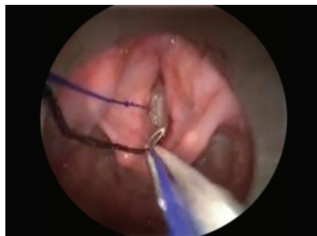
Fig. 3: Needle in place with 3-0 Prolene

The positions of needles were confirmed by endoscopy taking care to see one needle is above the vocal cords and one below the vocal cords; 3-0 Prolene was introduced into the lower needle from outside. This is pictorially observed in Figure 3. It was grasped by a microlaryngeal needle holder. It was then redirected to pass through the upper needle from within the airway to