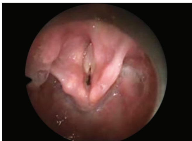
Fig. 1: Preoperative vocal cord status