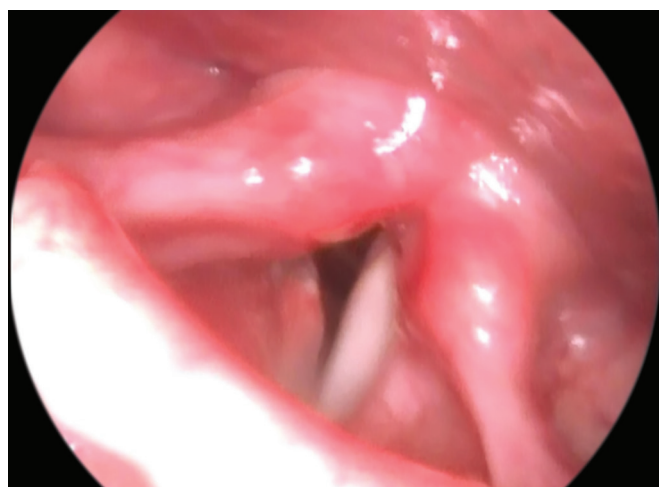
Fig. 1: Post-Kashima's surgery (4 weeks)

Dyspnea index score is a subjective measure of breathing quality. It is based on answers given to seven