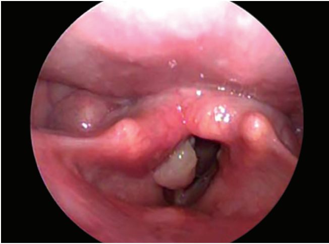
Fig. 1: Aryepiglottic fold