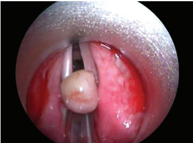
Fig. 3: False vocal cords