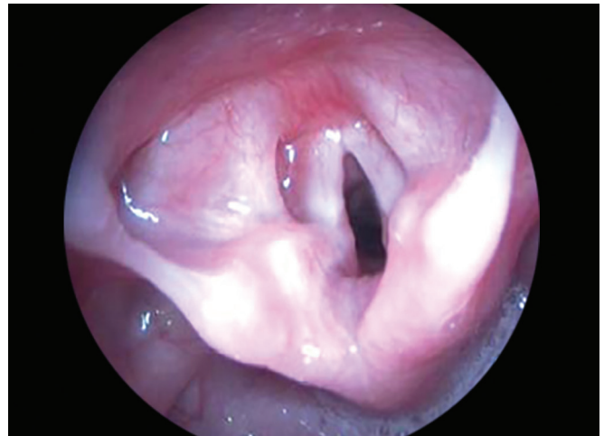
Fig. 4: Ventricle

The cystic mass rests on anterior commissure and moves during phonation. Though the vocal cord mobility appears normal because of the presence of mass, vocal cords will not adduct completely creating phonatory gap which results in breathy dysphonia.