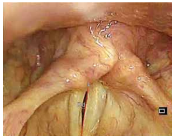
Fig. 4: Measuring phonatory gap in an image taken with vocal folds in maximum adducted position in a case of U/L (right sided) sulcus vocalis