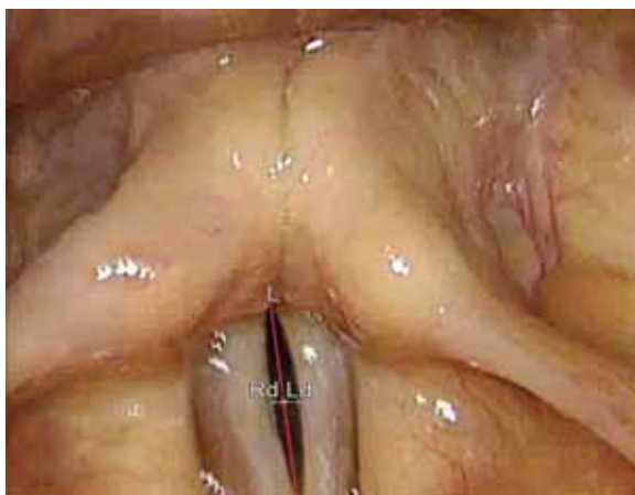
Fig. 3: Measuring phonatory gap in an image taken with vocal folds in maximum adducted position in a case of B/L sulcus vocalis