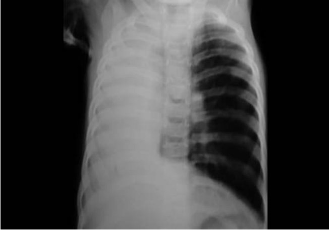
Fig. 1: Plain chest X-ray showing collapse of the right lung