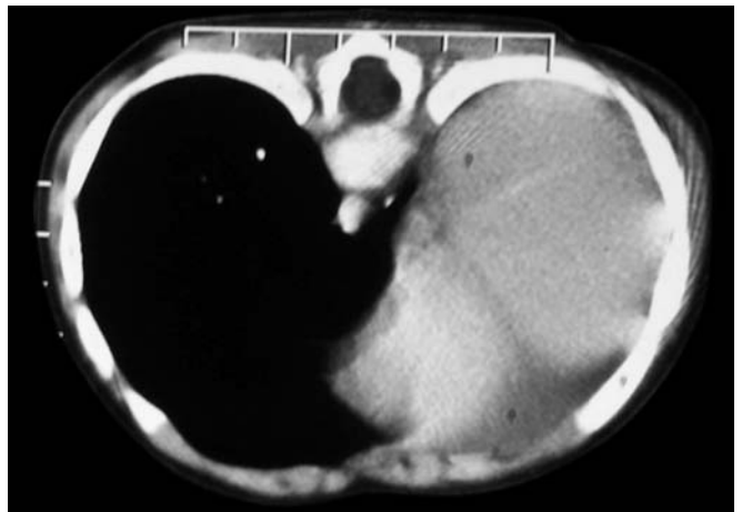
Fig. 4: Contrast CT scan of thorax (Axial view) showing absence of the right lung with mediastinal shift to the left

CT scan of chest after recovery of the child. This was reported as congenital agenesis of the right lung and hyper inflation of left lung to the right side (Figs 4 and 5). Electrocardiogram and ultrasonography of the abdomen were normal.