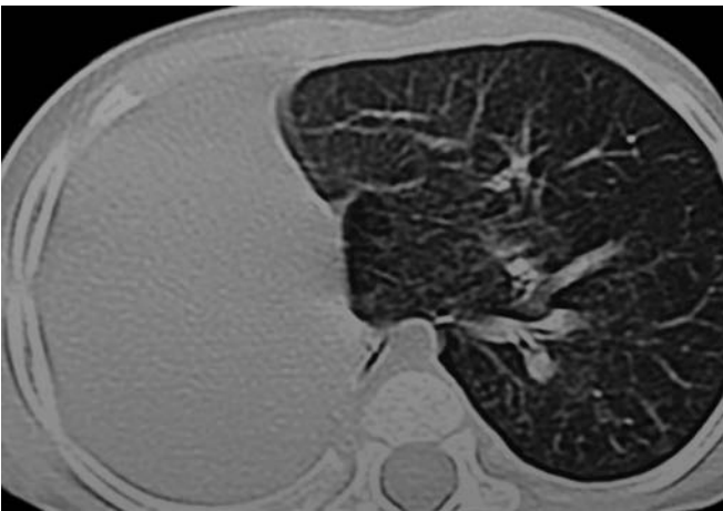
Fig. 3: Plain CT scan of thorax (Axial view) showing absence of the right lung