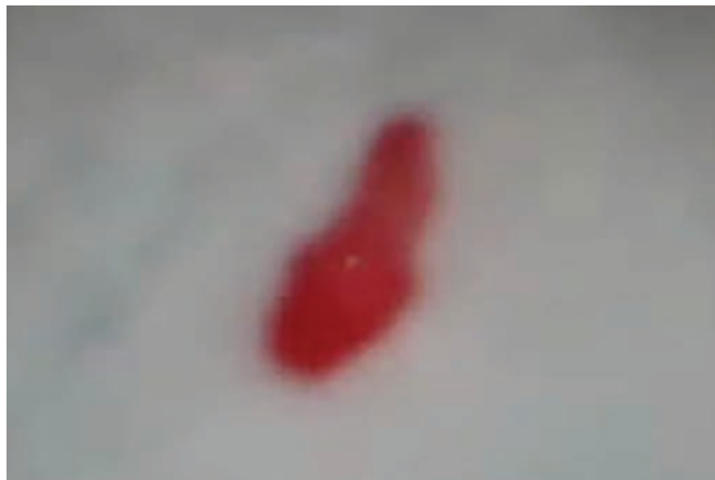
Fig. 3: Excised styloid process