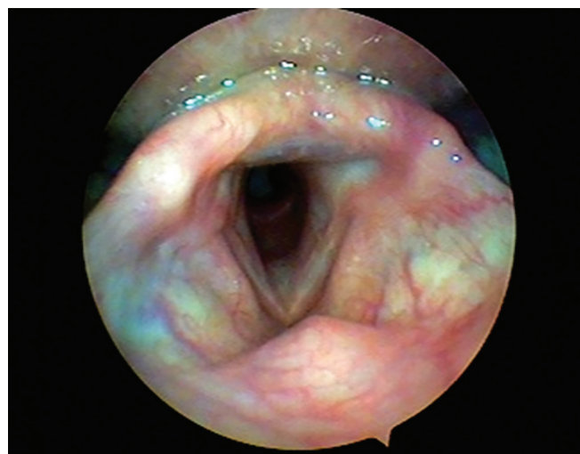
Fig. 3: Post antifungal treatment view of larynx showing normal appearance

Although, mycotic infection can occur in immunocompromised patients, sometimes these infections may be seen in the immunocompetent host in whom there are alterations in the mucosal barrier. 1