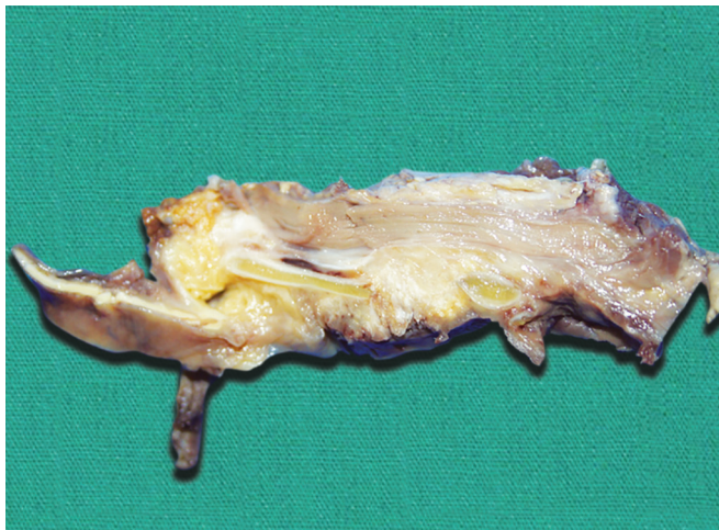
Fig. 1: Gross appearance of the laryngectomy specimen showing submucosal tumor