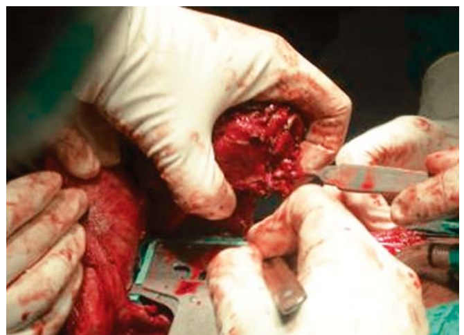
Fig. 3: The cricoid hook retraction of epiglottis during stapling