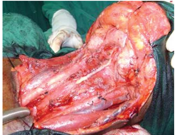
Fig. 1: Straight line closure achieved with a linear no. 60 stapler

Standard steps of laryngectomy are carried out and the larynx is skeletonized taking care not to open the pharynx. Superiorly, the suprahyoid muscles are severed till the mucosa of the vallecula exposing the hyoid bone and the thyroid cartilage. It is advised to preserve the thyrohyoid ligament, which will help in easier application of the stapler by preventing entrapment of the hyoid in the stapler line.