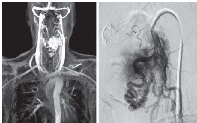
Fig. 2: MRI angiography and DSA showing embolization

Direct laryngoscopic evaluation was done in 48 hours and the pulsatile vascular lesion was assessed and approached from a lateral pharyngotomy incision. An elective tracheostomy was done to secure the patient's airway before lateral pharyngotomy with minimal blood loss. Intraoperatively, the larynx was approached and the thyroid ala dissected and left superior thyroid artery was ligated and cut along with the superior laryngeal nerve. The subglottis was normal, as was the base of the tongue and pharynx (Fig. 3).