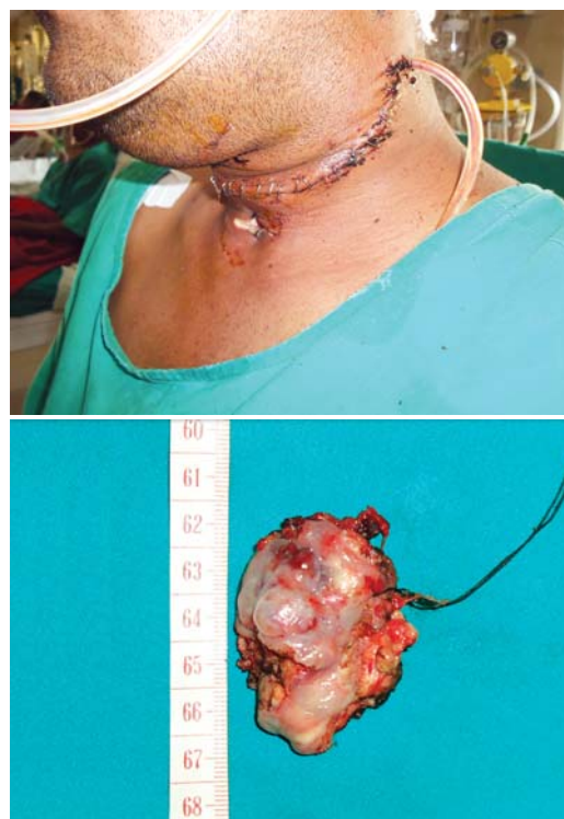
Fig. 3: Lateral pharyngotomy approach with the tumor specimen

Later the thyroid cartilage was dissected and the tumor was excised. He was extubated with the postoperative period being uneventful. Histopathology revealed features suggestive of paraganglioma and all the lymph nodes had reactive changes. Microscopic examination showed polygonal epithelioid cells arranged in discrete nests (Zellballen pattern). Immunohistochemistry results showed that the neoplastic cells were positive for chromogranin, synaptophysin and S-100 but negative for CK and epithelial membrane antigen (EMA). So, all these features were consistent with paraganglioma.