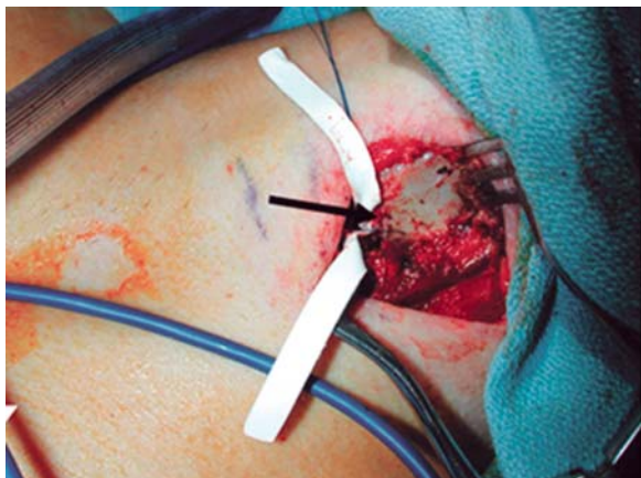
Fig. 2: Folding in Gore-Tex ribbon through the thyroid cartilage window